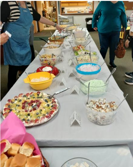
GOODS AND GOODIES SALE July 18 th

Collections are in full swing for the goods & goodies sale. Please make sure the items are clean and sellable. Please bring your items by July 11 th so we can price and prepare that last week.