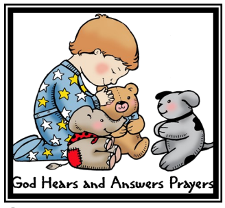
In Our Prayers! Families, Friends & Neighbors....

Anniversaries for January None on record this month