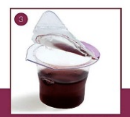
Peel back the second seal to drink the juice