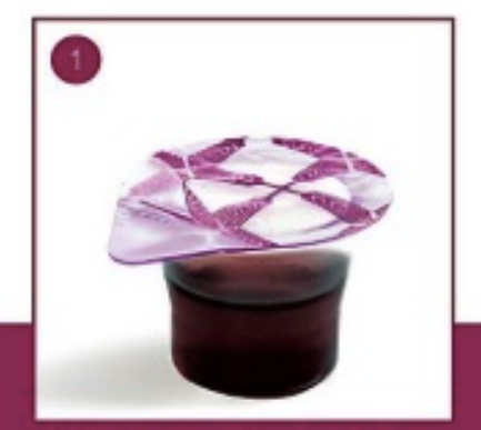
Designed to fit perfectly in communion trays

The Fellowship Cup requires no special preparation or refrigeration. It is also designed to fit in standard Communion trays. Using the cup is as easy as . . .