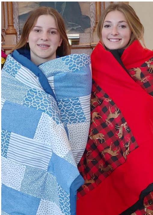
AFFIRMATION OF BAPTISM