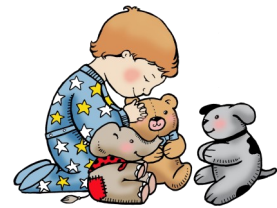
God Hears and Answers Prayers