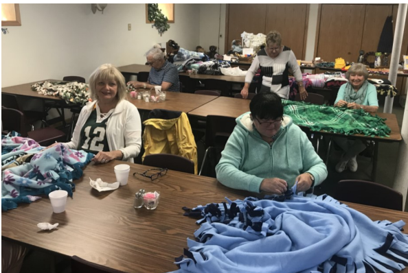
Fleece blanket helpers needed!