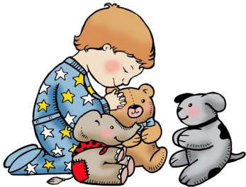
God Hears and Answers Prayers